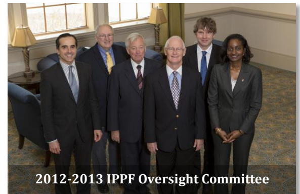
2012-2013 IPPF Oversight Committee

The IIA uses a multimedia approach to advance the profession by sharing key messages online and in printed materials and through AuditChannel.tv , Tone at the Top , social media, traditional media interviews, and the International Professional Practices Framework (IPPF) . The IPPF Oversight Council, an important collaboration in advancing internal audit awareness, was formed in 2010 to ensure the rigor of The IIA’s standard-setting process. Organizations represented on the Oversight Council include IFAC, INTOSAI, World Bank, OECD, and NACD.